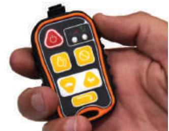
Wireless Controller – Control the engine speed using touchpad buttons.