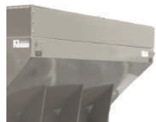
Side Extensions – Optional side extensions quickly increase hopper capacity.