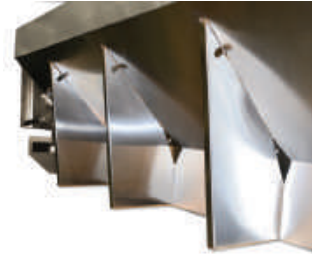
Hopper – Lighter hopper available in carbon steel or maintenance-free stainless steel.

Conveyor options include drag chain or belt-over-chain that delivers a consistent output of material, while not leaking into the hopper.