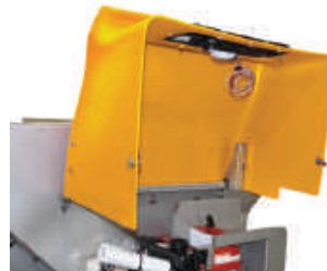
Gas Springs** – The gas springs hold the engine shroud in the open position during refueling and maintenance.

To make the Meyer ELITE spreaders more versatile, the following optional equipment is available: tarp kit, side extensions, vibrator kit and tie-down kit.