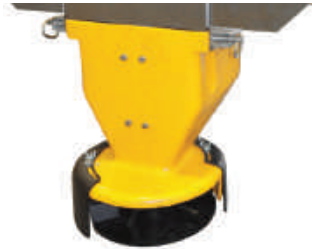
Spinner Chute – Forward handles and pins for easy on/off.

The wireless controller remotely allows the gas engine speed to throttle up, down and choke as well as turn on and off.